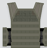
OD / OD